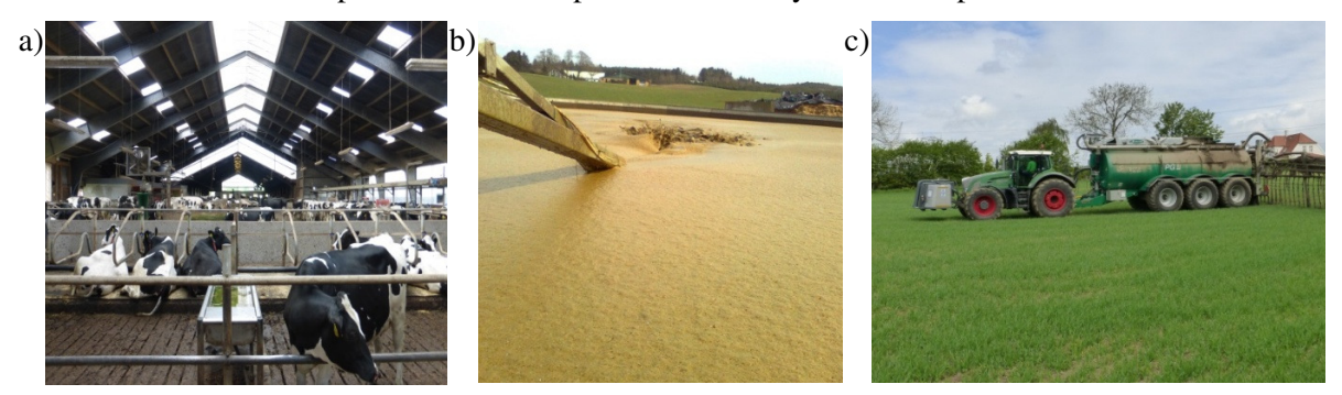
Fig. 2. Applicable acidification techniques: a – in-house; b – in-storage; c – in-field

Sulfuric acid is generally applied, since it is easy to use, affordable and relatively cheap. Besides, sulfur can be used for crop nutrition instead of mineral additives.